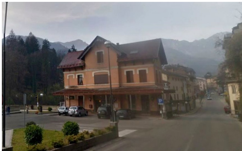
Recoaro Bus Station