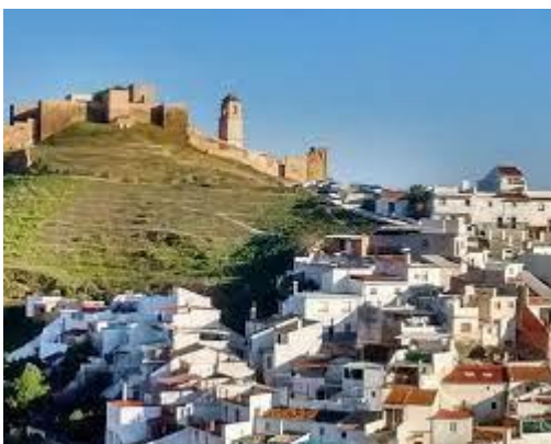
Castle of Álora

Location: Málaga province, Spain. Town of: Álora