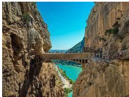
Caminito del Rey-El chorro